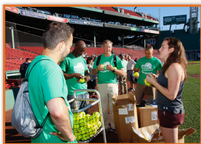
ABCD Volunteers planning the day at Field of Dreams

A huge thank you to all our teams for stepping up to the mound and supporting ABCD's SummerWorks program; to the Boston Red Sox for their generous organizational and logistical support and to our enthusiastic volunteers who generously give their time and help make each year's event better than the last.