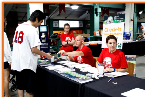
ABCD Volunteers greeting participants of Field of Dreams

While careful planning and tenacious volunteers can achieve many things, one that they cannot control is the fickle New England weather. With torrential downpours, the final innings of the day were postponed to August 19 to ensure that all of the teams got their shot at Fenway glory.